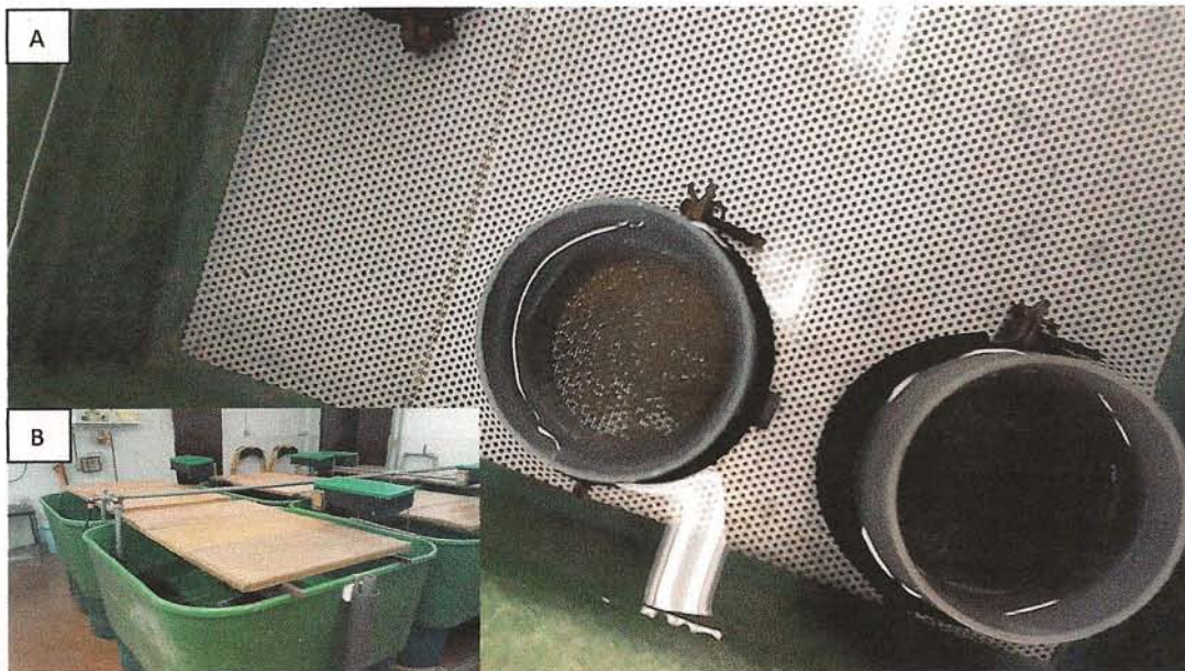
Figure 2- Hatchery experiments: A- Incubating egg samples after in vitro fertilization. B- Larval production tanks.